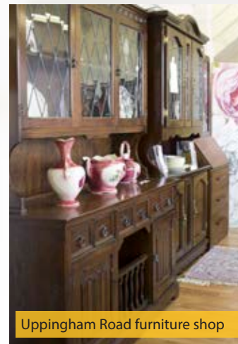
Uppingham Road furniture shop

Of course, there is our By Design shop in Market Street, Leicester, where you can find a huge range of high-quality branded clothes at affordable prices. Here, we also have a special 'by appointment only' wedding boutique, stocking a range of