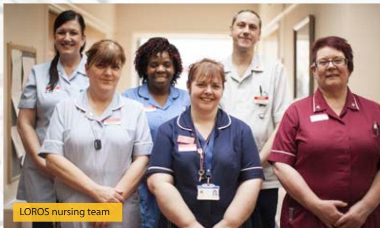
LOROS nursing team

We also have banking opportunities for Registered