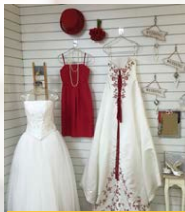
LOROS By Design shop, wedding boutique on Market Street

For our male supporters, our Wigston shop stocks