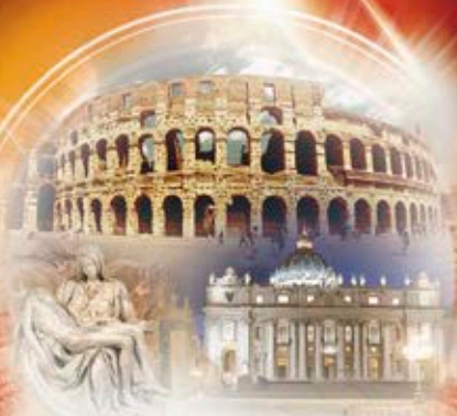
A 4* long weekend in Rome