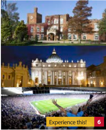
Experience this! 6