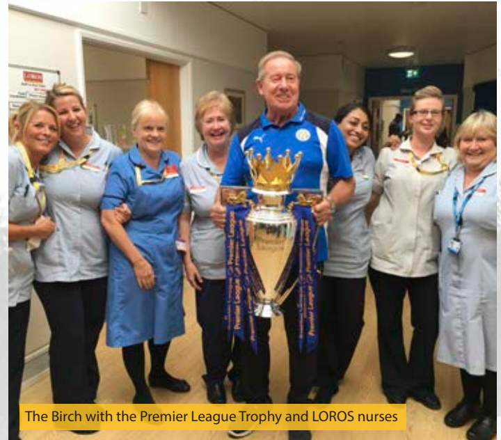
The Birch with the Premier League Trophy and LOROS nurses

As the week continued, LOROS held a Navratri event, which saw more than 100