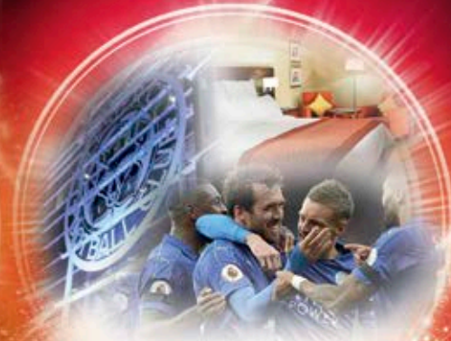
A weekend of Leicester City Football Club