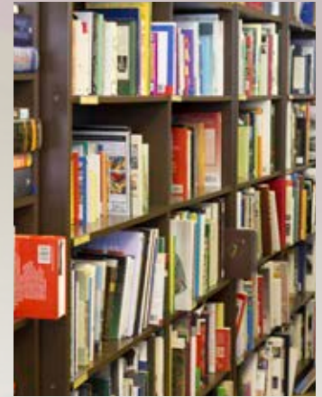
Pictured (L-R): LOROS menswear in Wigston, Uppingham Road children's shop, Spiral Scratch record shop on Queens Road and LOROS Bookshop in Clarendon Park.