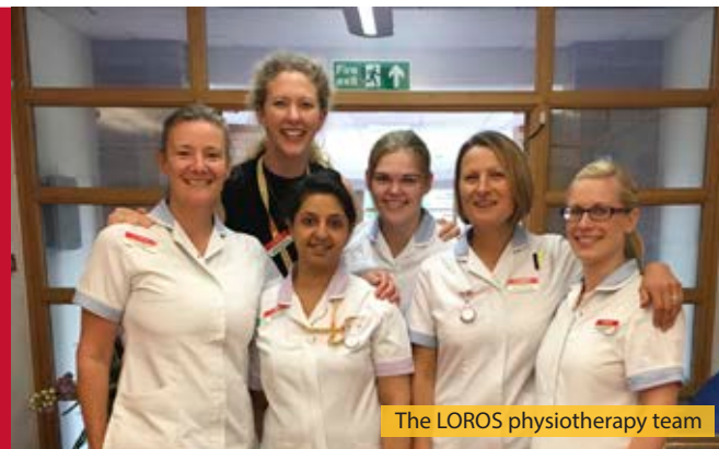
The LOROS physiotherapy team

9.30am: Some of us are in the daily morning MDT Meeting (multidisciplinary team meeting, which involves healthcare professionals from all LOROS teams) while others are already seeing patients.