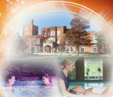
Two-night luxury spa break at Ragdale Hall