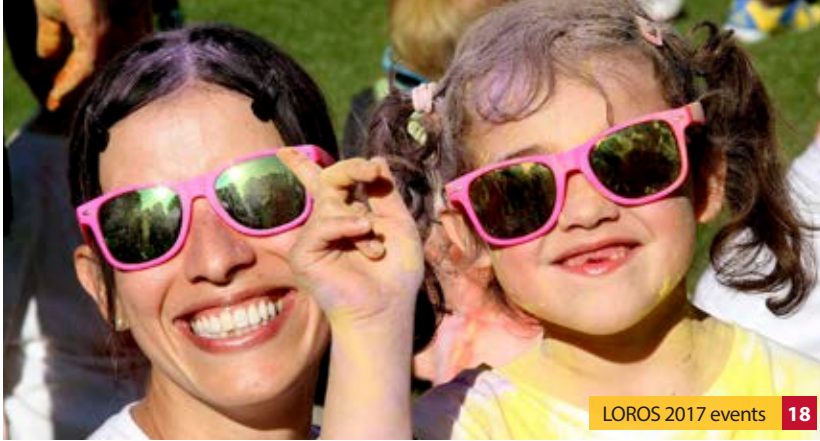
LOROS 2017 events 18