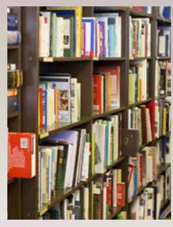
Pictured (L-R): LOROS menswear in Wigston, Uppingham Road children's shop, Spiral Scratch record shop on Queens Road and LOROS Bookshop in Clarendon Park.