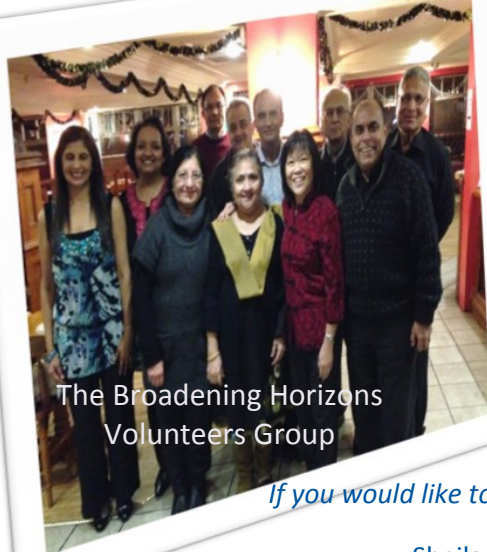
The Broadening Horizons Volunteers Group

The goal of this short, amateur collaboration was to showcase the diversity and versatility of the project volunteers, who give basic information regarding the Hospice and its services using languages which are familiar to many members of the population of the area. The hope is that when it is used in awareness-raising sessions it will encourage more patients from the many diverse minority communities to consider using the palliative care services available to them.